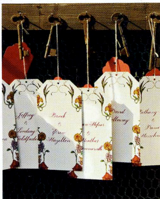
The couple hung escort cards on vintage skeleton keys from Zaborski Emporium ( stanthejunkman.com ).