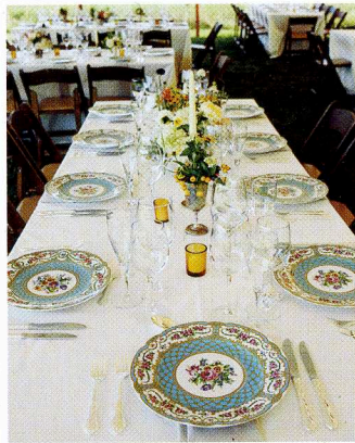
To create a homey, dinner-party feel, the couple rented vintage-looking china (in fortuitously coordinating colors).