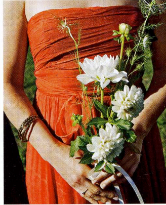
The bridesmaids carried free-form bouquets of white dahlias. Saipua ( saipua.com ) handled the flowers.