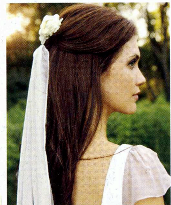
The bride's dress and headpiece (topped with wild roses) were designed by Vena Cava ( venacavanyc.com ).