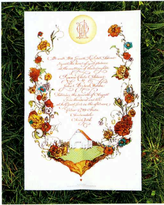
The 9-by-12-inch invitations featured the barn, a custom monogram, and playful, personality-infused illustrations.